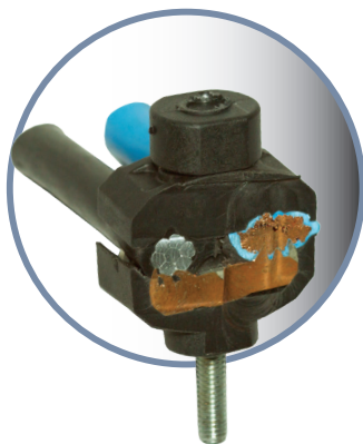
Connector cross-sectional image

Additional information can be obtained from our Technical Product Specification ETE-085.